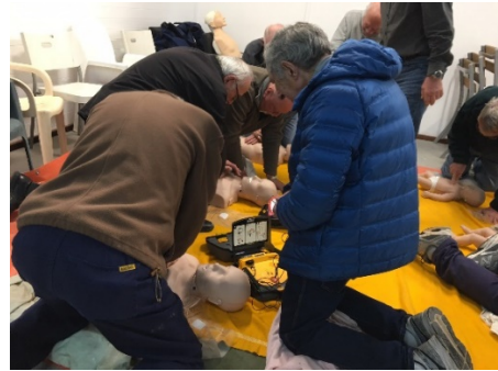
Some of the members practicing their CPR and Defibrillator skills.