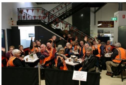
All excited after the safety briefing