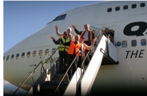
New arrivals to Australia and potential new MMS members. They look very happy.