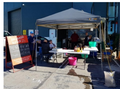
Fund raising 'Sausage Sizzle' held at Bunnings Caringbah. It should be noted that Bunnings are very strong supporters of the Menai Men's Shed.