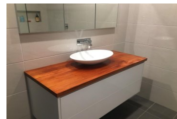
Vanity cabinet top built for a member of the community.