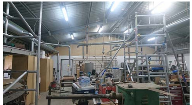
Extraction system completed. Then came the clean-up.. Where is Tom??