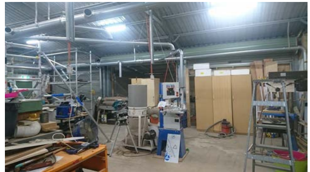
Extraction system partially completed..